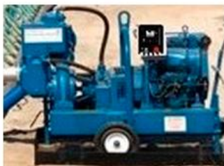
Diesel Engine Pump