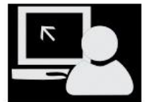
TRACK YOUR ASSETS