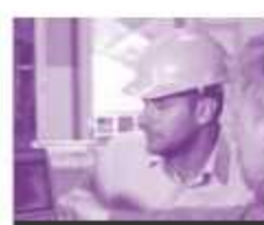
Service & Support

LOAD SHARING & SYNCHRONISING CONTROL PANEL PUMP CONTROL PANEL ENGINE CONTROL PANEL & END DEVICES